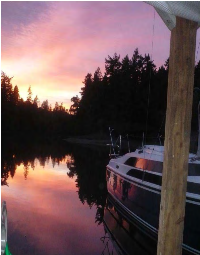
Longbranch Sunset- Lynn Lloyd

PRESENTED BY LIC WITH KEY PENINSULA FARM TOUR