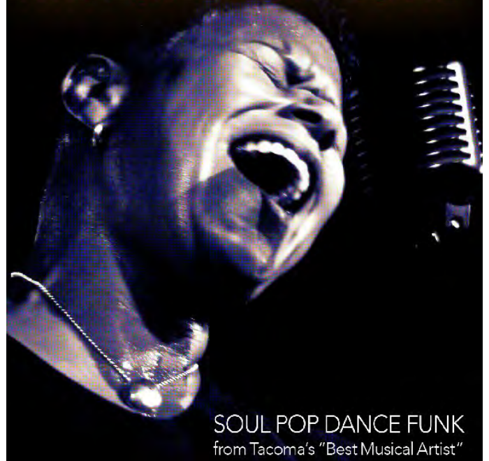
SOUL POP DANCE FUNK from Tacoma's "Best Musical Artist"