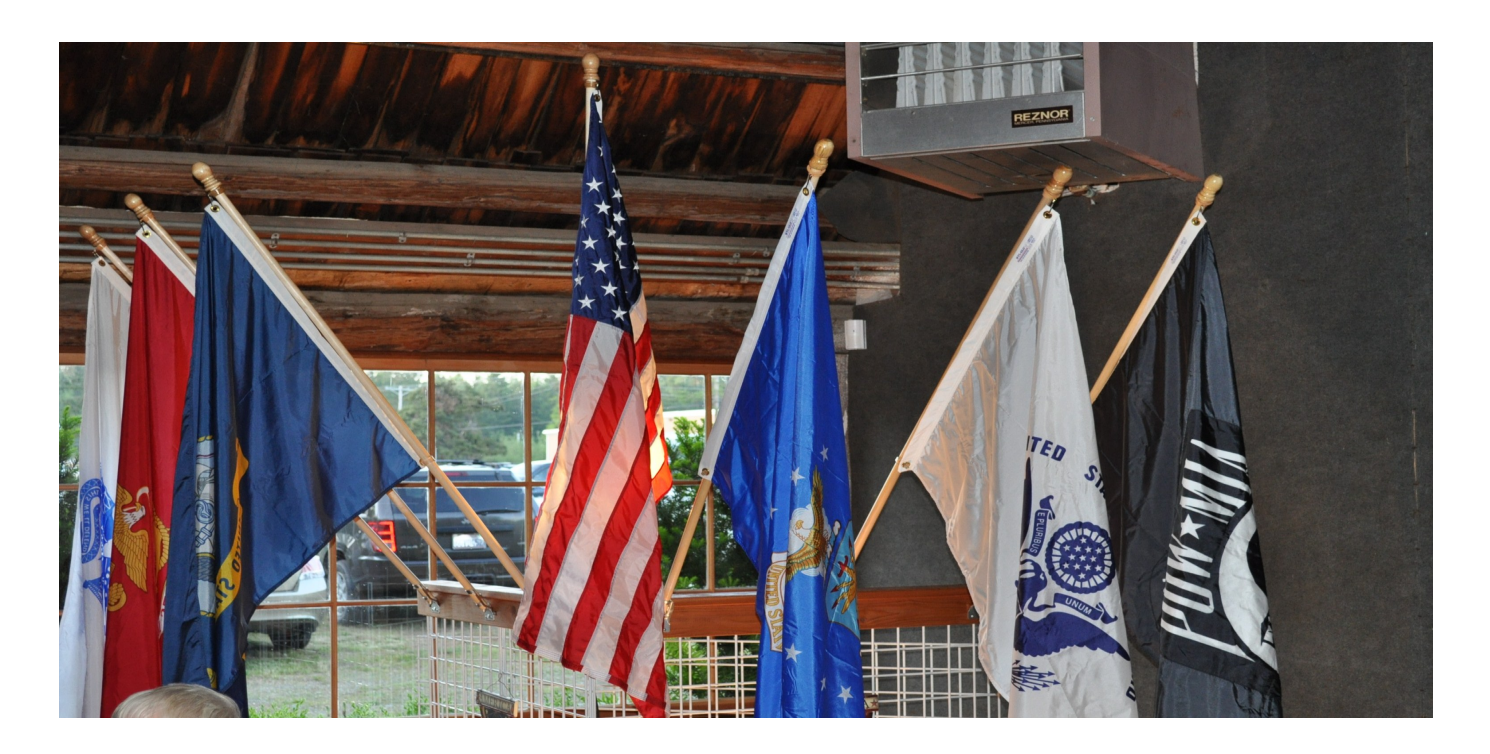
Tribute to our troops at the Memorial Dance, May 26.