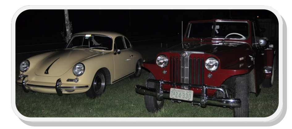
Memorial Dance Saturday, May 26